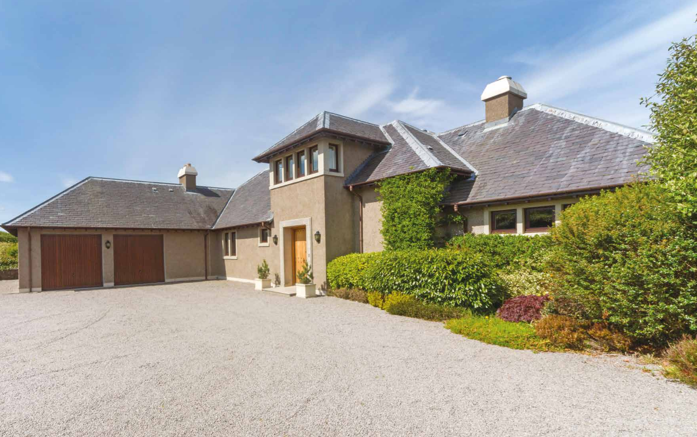
Califer Croft & Califer Croft Cottage Rafford, Forres