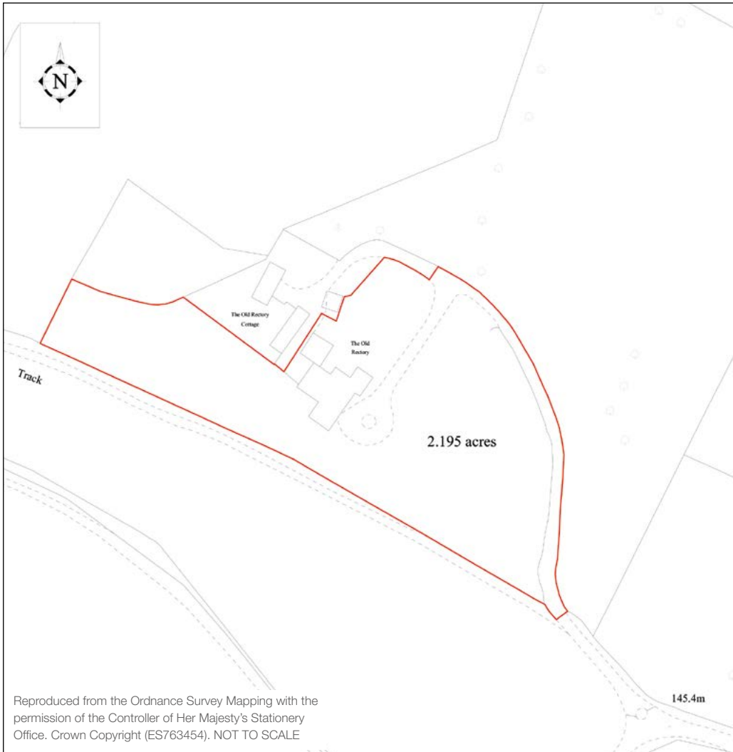
Reproduced from the Ordnance Survey Mapping with the permission of the Controller of Her Majesty's Stationery Office. Crown Copyright (ES763454). NOT TO SCALE

From Canterbury proceed onto the A2 towards Dover. After about 5 miles take the A260 turning towards Folkestone. After approximately 5 miles, in Densole, turn right (signposted to Alkham), follow the lane and drop down in to the valley, bending round to the left. Where the road bends sharply to the right, turn left into the drive of The Old Rectory.