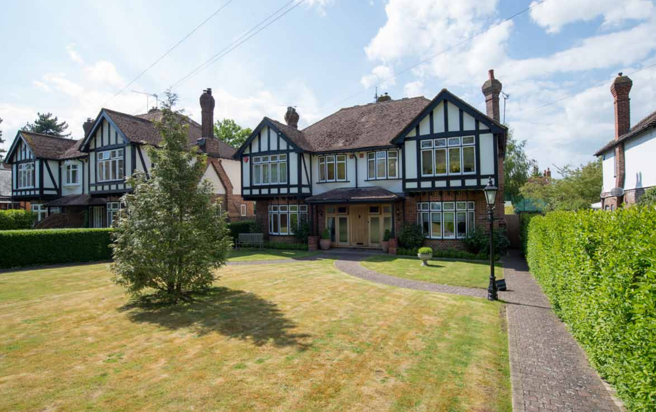
St Lawrence House Canterbury, Kent