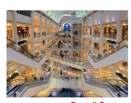
Bentall Centre, Kingston-upon-Thames